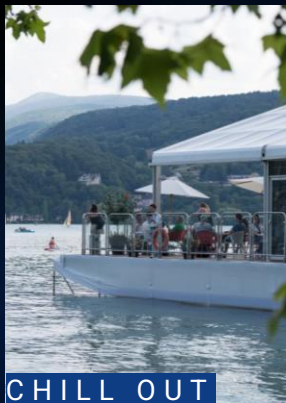
CHILL OUT AREA