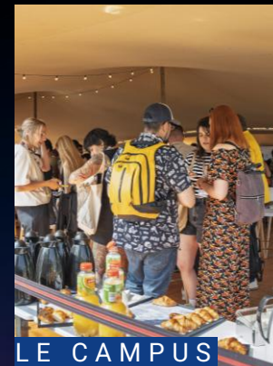
LE CAMPUS MIFA