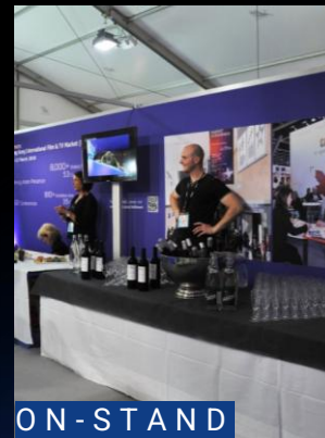
ON-STAND COCKTAIL PARTIES EXHIBITION AREA