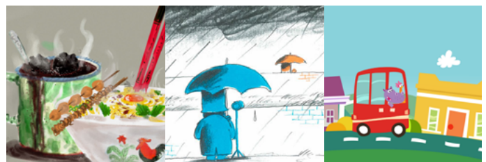
RODA PANTURA, HIZKIA SUBIYANTORO